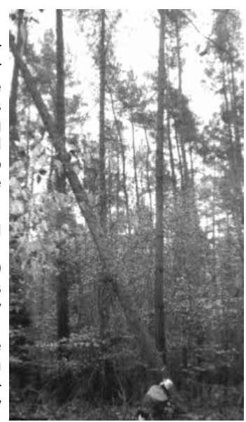
Infected larch being felled in the Forest of Dean

Phytophthora ramorum is the same pathogen that has caused 'Sudden Oak Death' in North America for the last decade. In fact, it does not seem directly to affect our European oak, but in 2009 one of its variants was found to have jumped from its original hosts in the rhododendron family to begin killing Japanese larch, a key forest species in north-west Europe, particularly the western UK. Since then this highly virulent strain, has gone on to kill large swathes of forest in Wales and western England. On the Maiden Bradley Estate there are 107 hectares (288 acres) of larch – around 1/7<sup>th</sup> of the total area of the Estate's woods and this is now under significant threat.